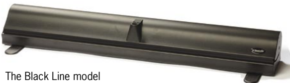
The Black Line model comes in 88 cm width / height 212 cm.

The BannerUp programme is now expanding and also includes a "Black Line" model. The cassette has a sophisticated black semi-matte finish and gives a very elegant impression. The surface is highly scratch-proof as well. Ideal for hotels, reception areas, high-class shops etc., and gives further possibilities to match perfectly the graphics.